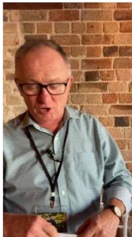
DOMAINE DES TILLEULES